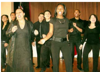
Hollywood High Choir at the December luncheon 2007.